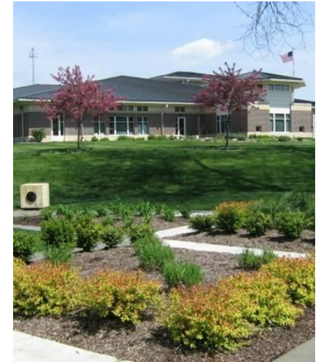
Charles Gabus Memorial Tree Park and Gardens